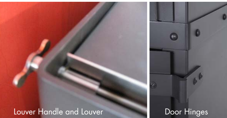
Louver Handle and Louver